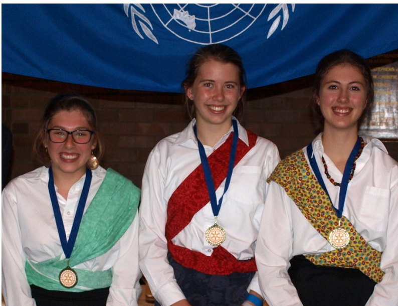
Winner of Peace prize – Germany – Frensham School

Winner of overall debate – Moss Vale High representing Sweden