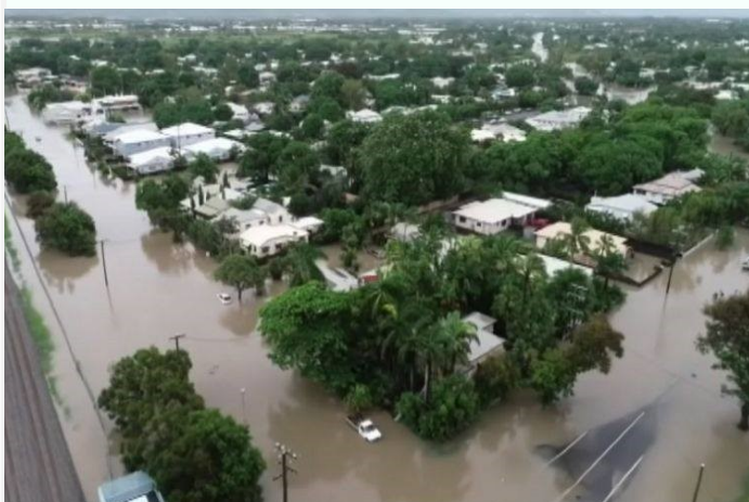
Photo: Aerial view of the devastation caused by floods in Townsville

Tax deductible donations are welcomed from individuals or organisations.