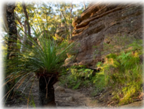
(pic) Garigal Land, Berowra