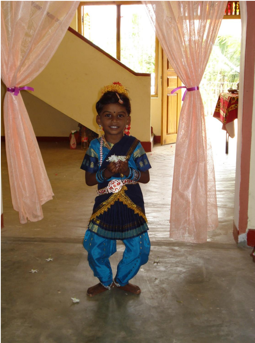
The youngest dancer - Aged four