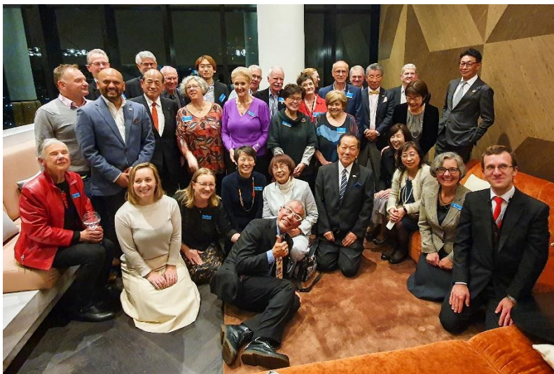
Sister Club Osaka-Midosuji Hommachi dinner prior to the Rotary International Convention