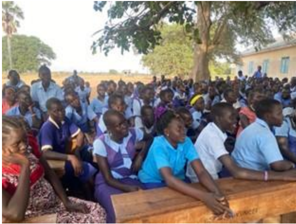
Learning about menstruation, South Sudan