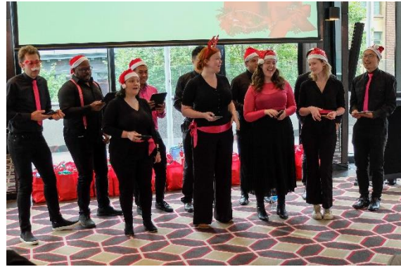
Harambee a cappella singers at Christmas breakfast