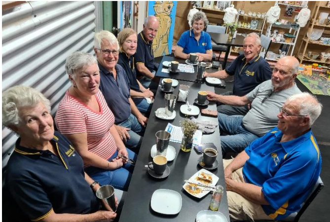
Lunch during Rochester working bee