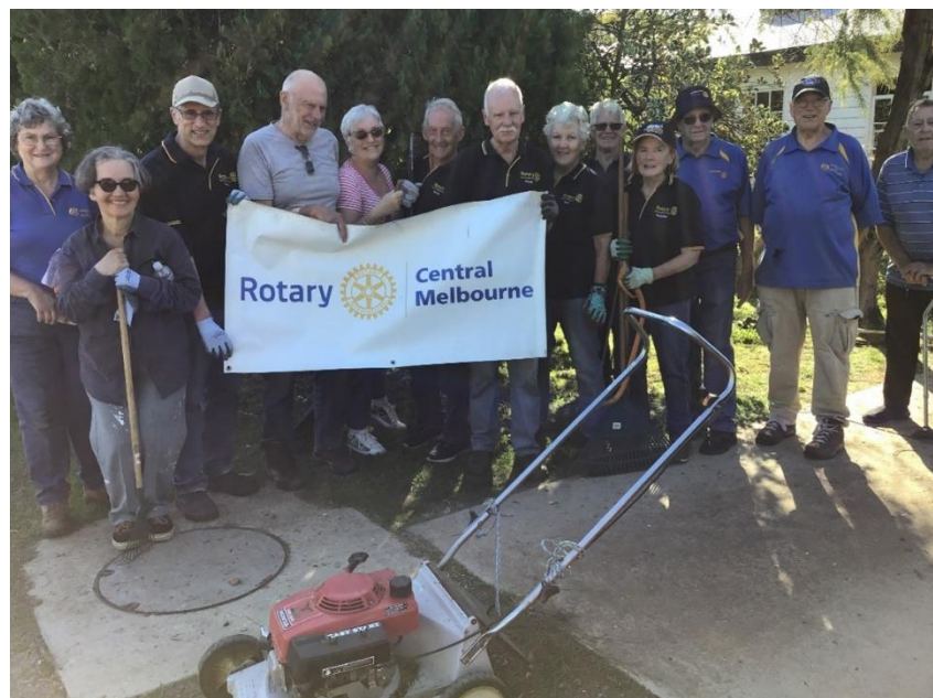
Working bee at Rochester with Sister Club Echuca-Moama