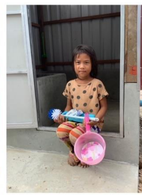
Cambodian clean water and sanitation project