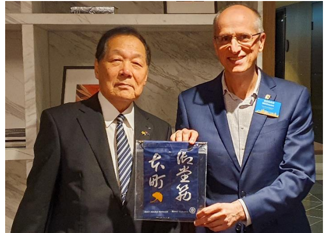
Sister Club Osaka-Midosuji Hommachi dinner