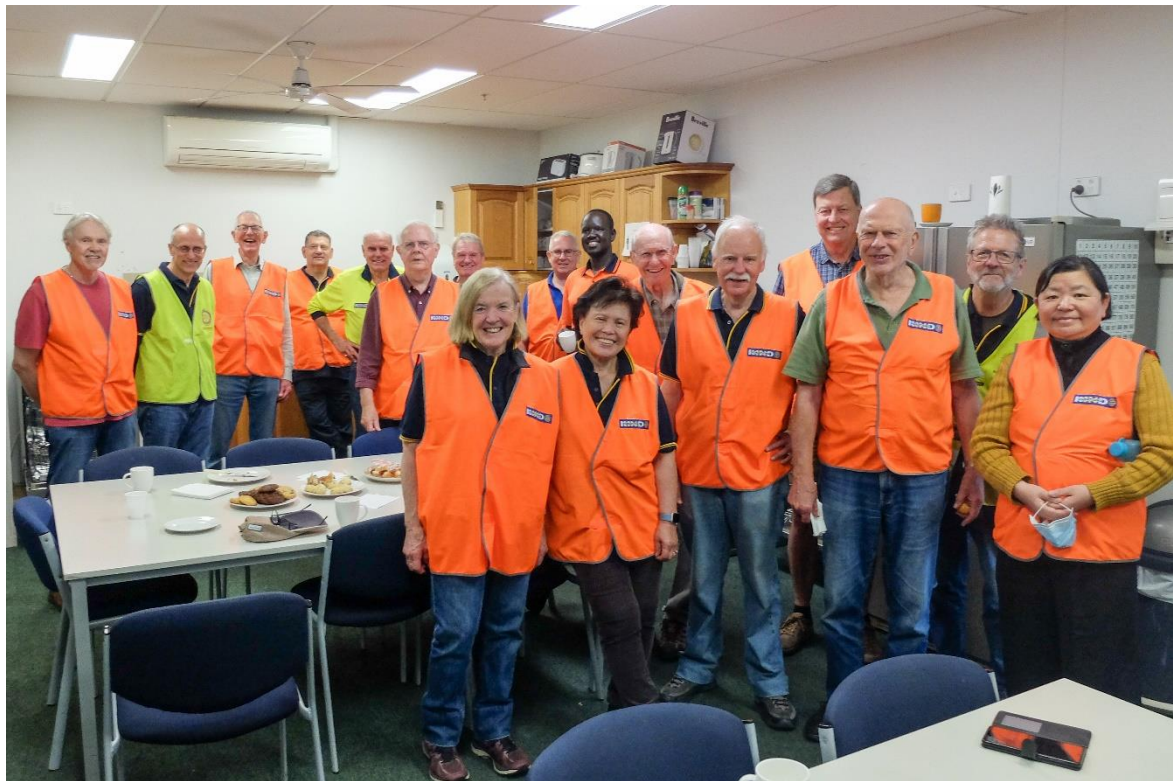
Workers at Donations-in-Kind