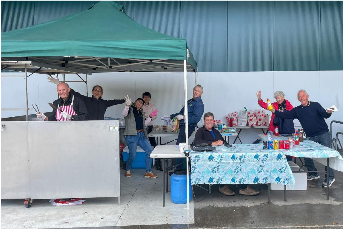
The Port Melbourne Bunnings team