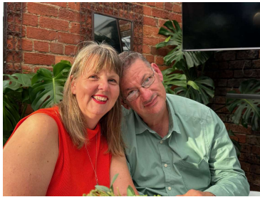
Emerald Hotel social dinner