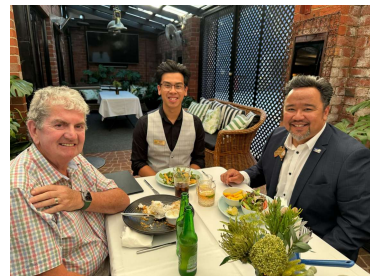
Emerald Hotel social dinner