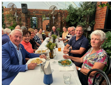
Emerald Hotel social dinner