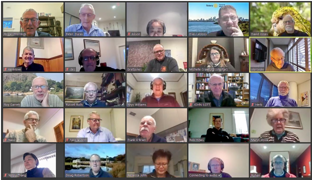
RCM Members on the call