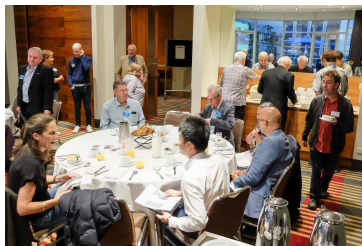
Queuing for breakfast