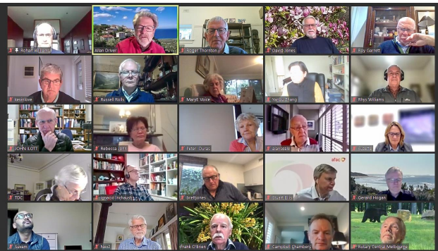
Members and guests on the call