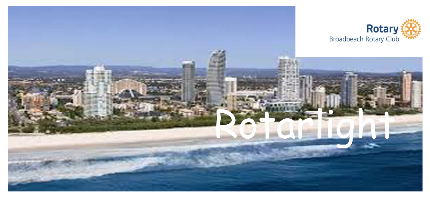
Issue #7 August 18 2015