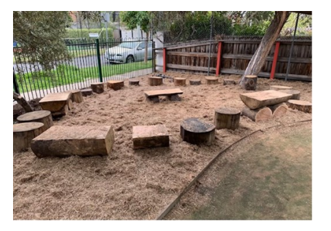
Primary School Discussion Area