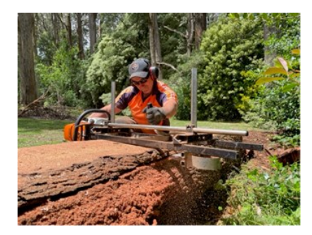
Log Recovery and Processing

The most important need that has currently been identified now, is the need to assist people with fallen trees on their property who have no means of clearing the heavy logs and branches, that have now become a fire hazard. Two organisations, working on this huge task, are working with the Yarra Ranges and Cardinia Councils . Rotary is supplying materials and funding to help these organisations clear land of families in need that are referred to them, through Anglicare and Windermere Community Services . These organisations are Treasure our Trees , which is a group of people supporting Professional Arborists, to clear the land of trees which are mostly in dangerous states and need expert knowledge to dismantle their entanglement. Treasure our Trees are recovering the logs and, in some cases, using them to build playgrounds and gardens in the schools on the mountain. The second organisation that the Rotary Fund is helping is Habitat for Humanity . This is an organisation that supervises volunteers who are formed into teams to go onto properties to clear the mess that the storm has left behind.