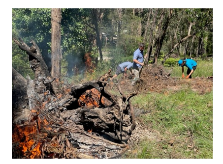
Volunteers at Work