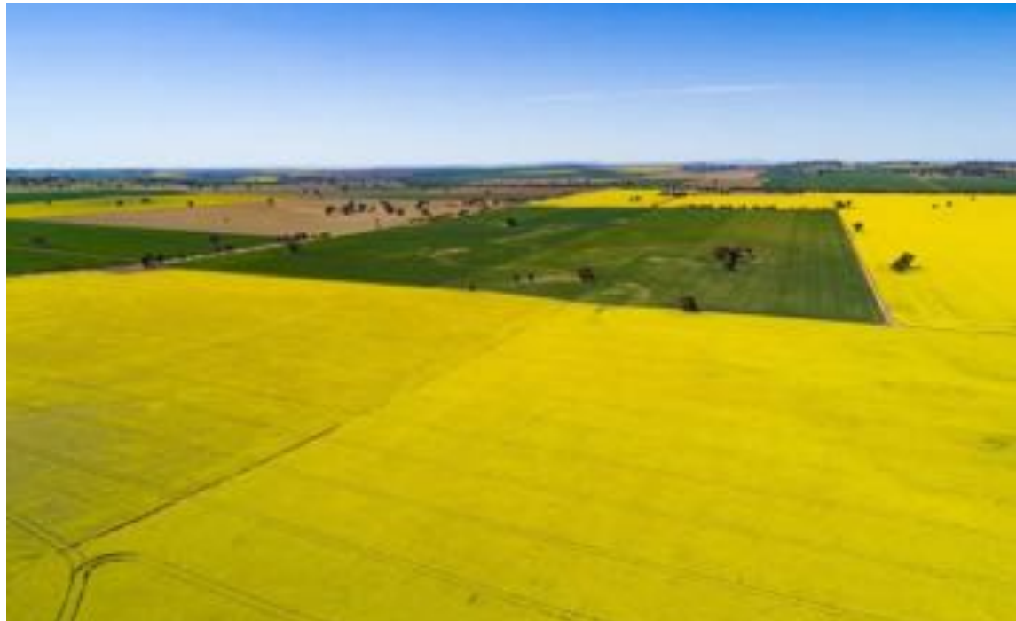
Canola in flower