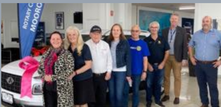
Rotary members handing over the prizes.

The selling period will be from September to December with the draw on 31/12/22.