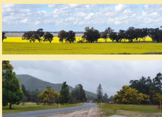
Gold in our spring landscape