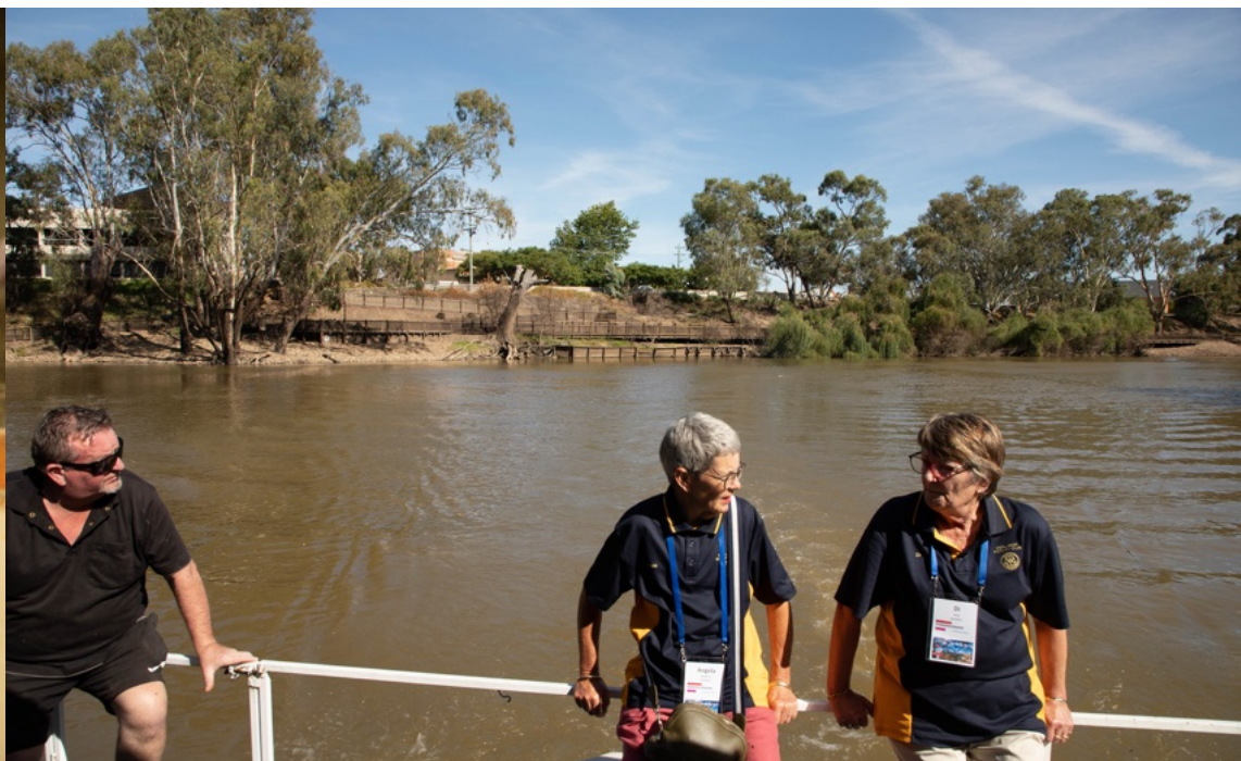
Houseboat ride on the Edward River in Deniliquin