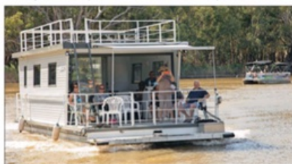
District Rotarians and their guests took to the water on Saturday. It was one of many voluntary activities on offer to showcase Deni and district.