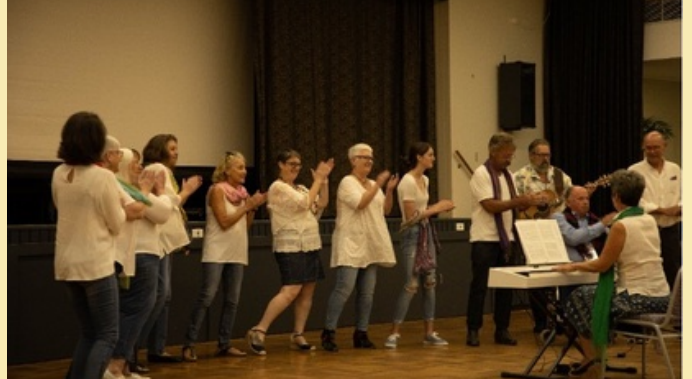
Con Spirito Voices Choir performed 'Imagine'