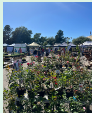
Whittlesea Garden Expo 2023