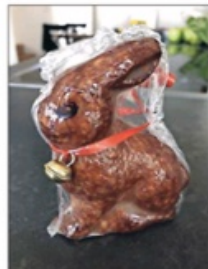
A salami Easter bunny made in Switzerland.