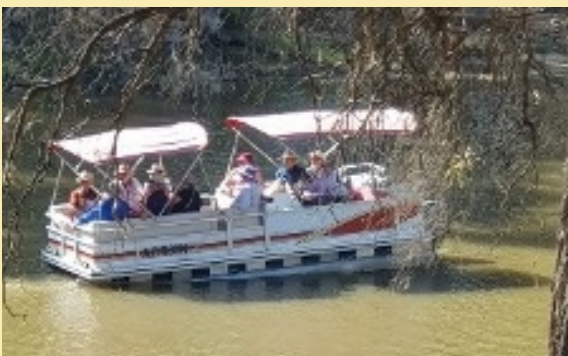
Maybe a bit too much breakfast!