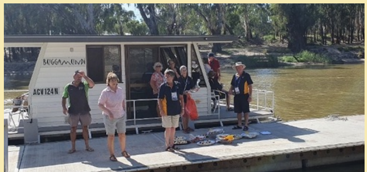
Scones with Jam & cream for morning tea on the River