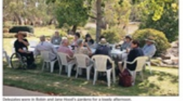
Deniliquin Rotarians were in Deni and saw Deni's gardens for a lovely afternoon.