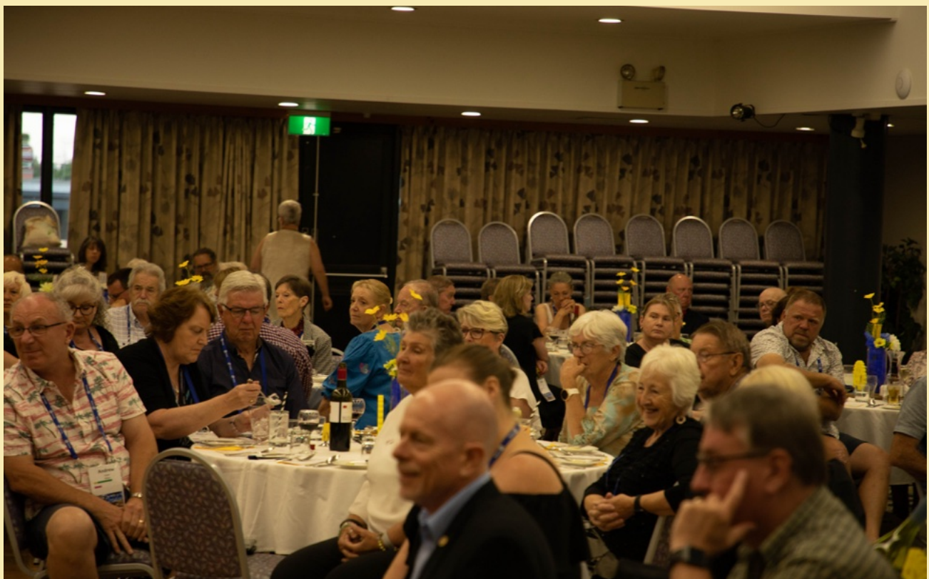
Rotarians at the Gala Dinner at the Deniliquin RSL