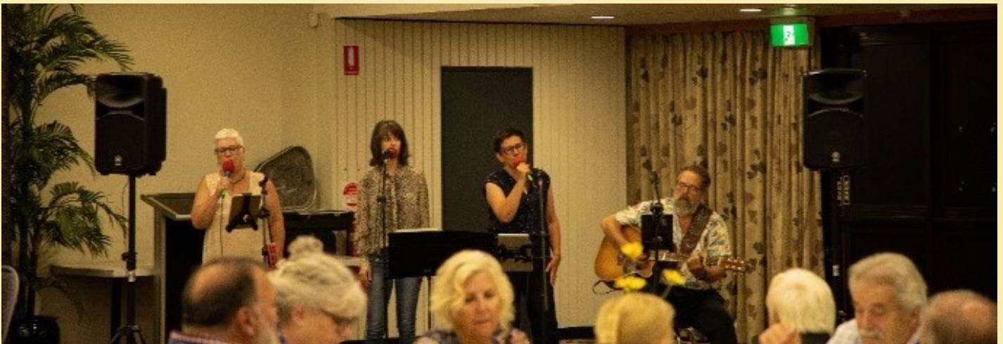
Ruby Saltbush entertained guests