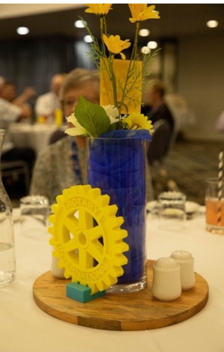
Table decoration - Gala Dinner