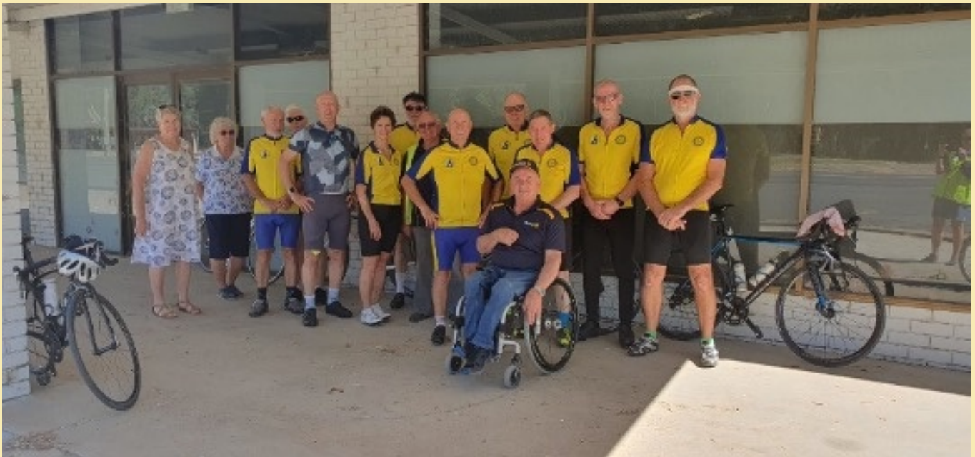
Ride to Conference participants