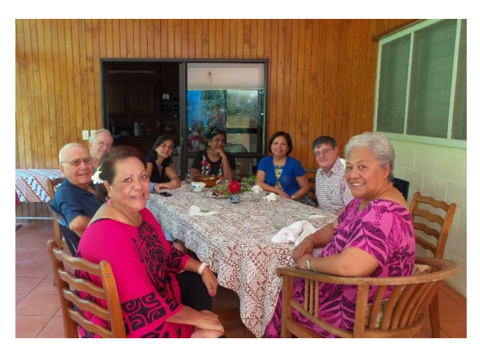
Lunch with the Prime Minister of Samoa, Fiame Naomi Mata'afa.