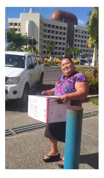
Parcel of hearing aid spare parts arriving in Samoa