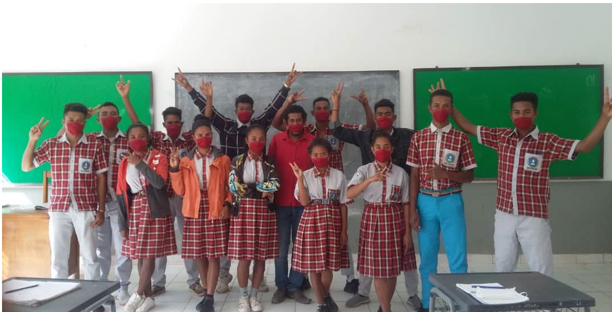
Hatubelico District School Students