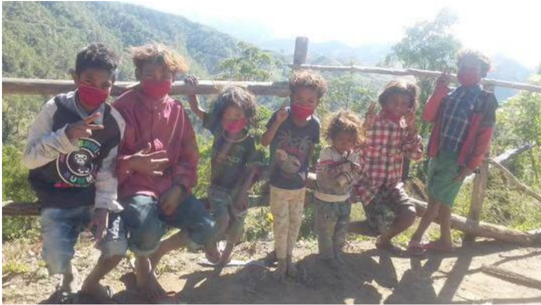
Children in remote Districts