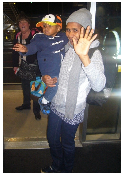
12 July 2016: Goodbye