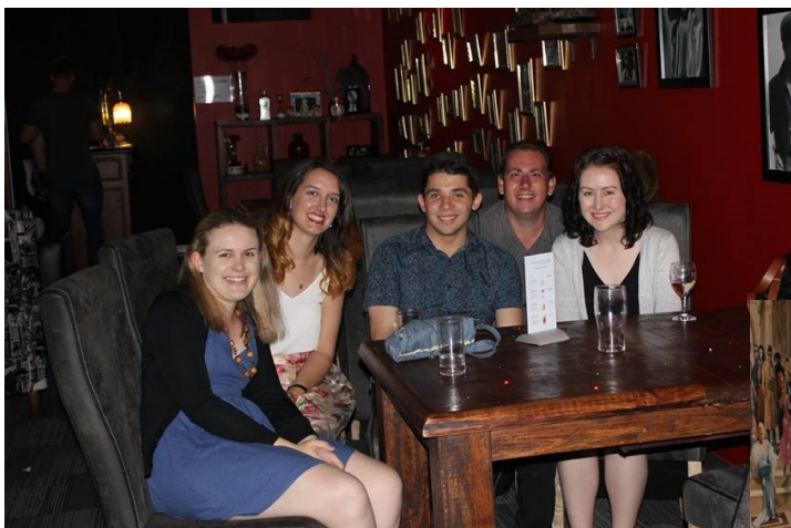
Left & Below: Some of the crowd.