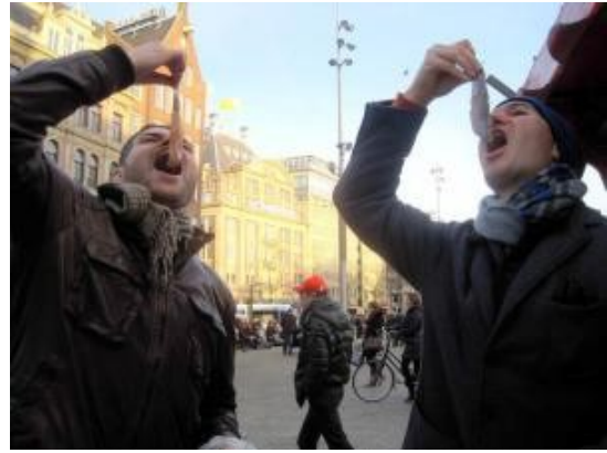
Herrings (and how to eat them!)