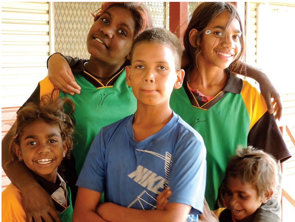
Canteen Creek Kids