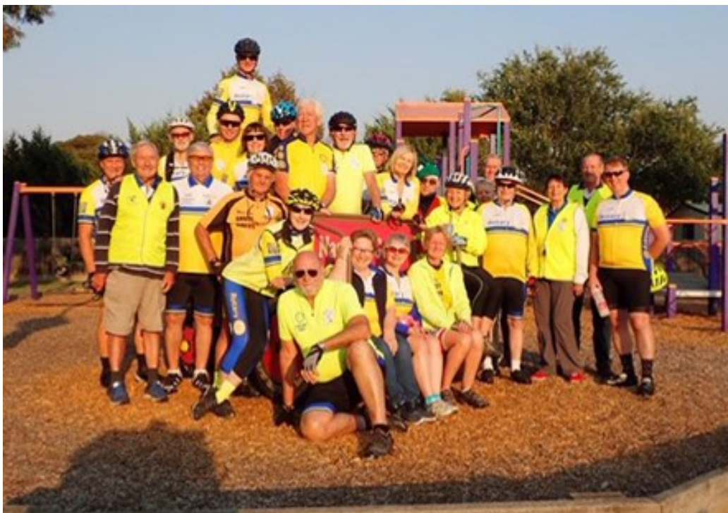
Some of the riders and support crew minutes before taking off from Nar Nar Goon.