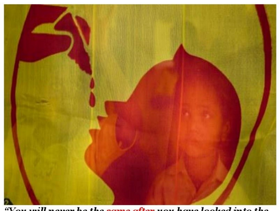
"You will never be the same after you have looked into the appreciative eyes of someone whose life you have changed"