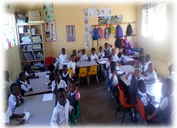
Grade 1 classroom