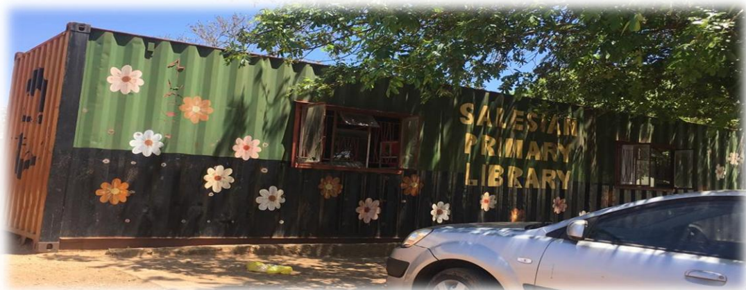
School container library