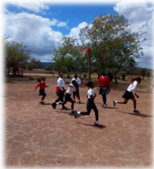
Students playing basketball