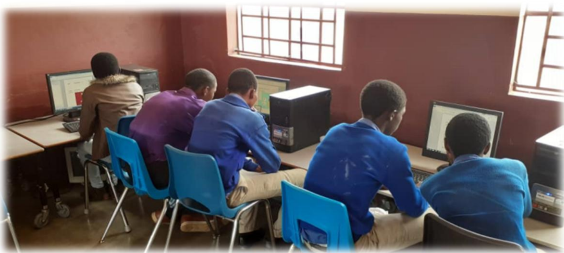
School computer lab.