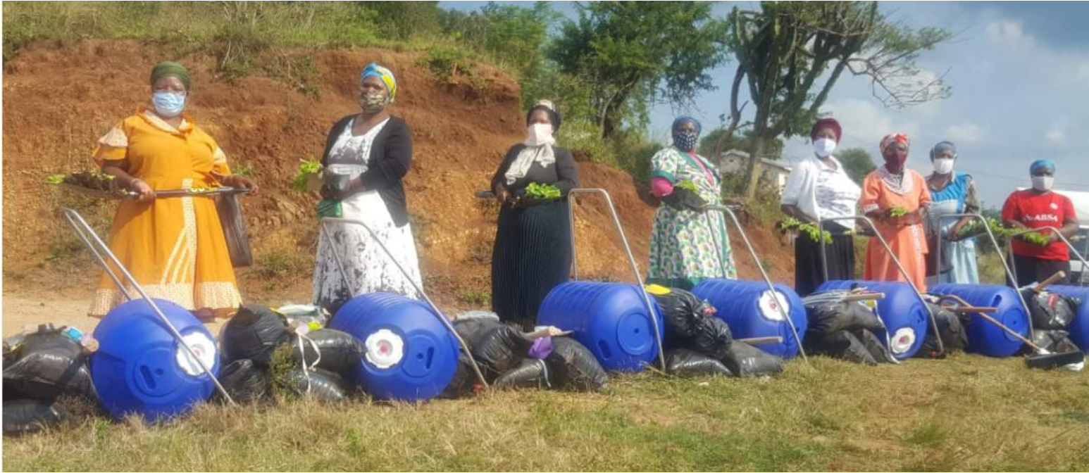
Joyful recipients from the Valley of 1000 Hills who received their Survival Garden kits in May 2021