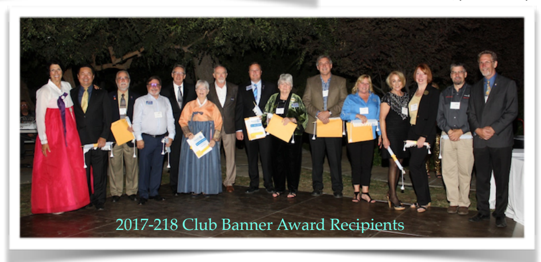
(Sees Foundation Banner Recognition Status on page X)