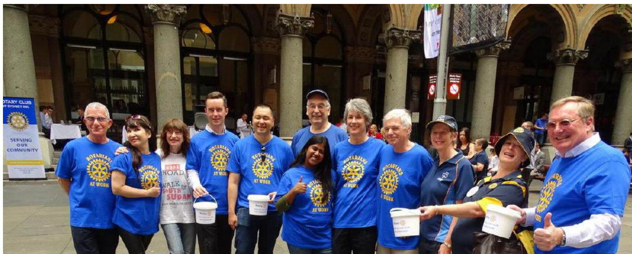
A very happy gathering in Martin Place after 'The Dance' 27 th November 2015