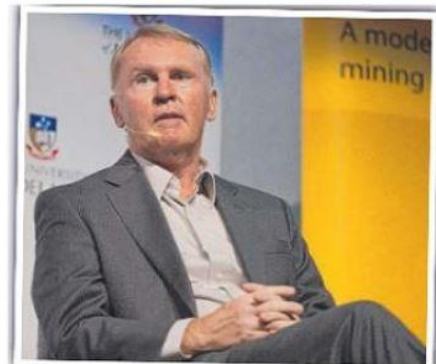
Adelaide astronaut Andy Thomas.