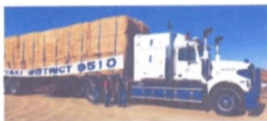
More information about the day inside.