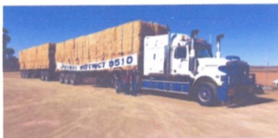
Truck after it arrived in Hawker ready to unload