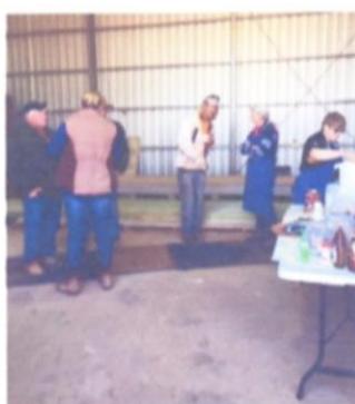
Enjoying the Barbeque breakfast and coffee in the sunshine