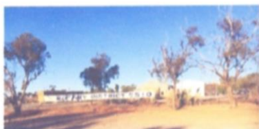
Rotary banner displayed on fence