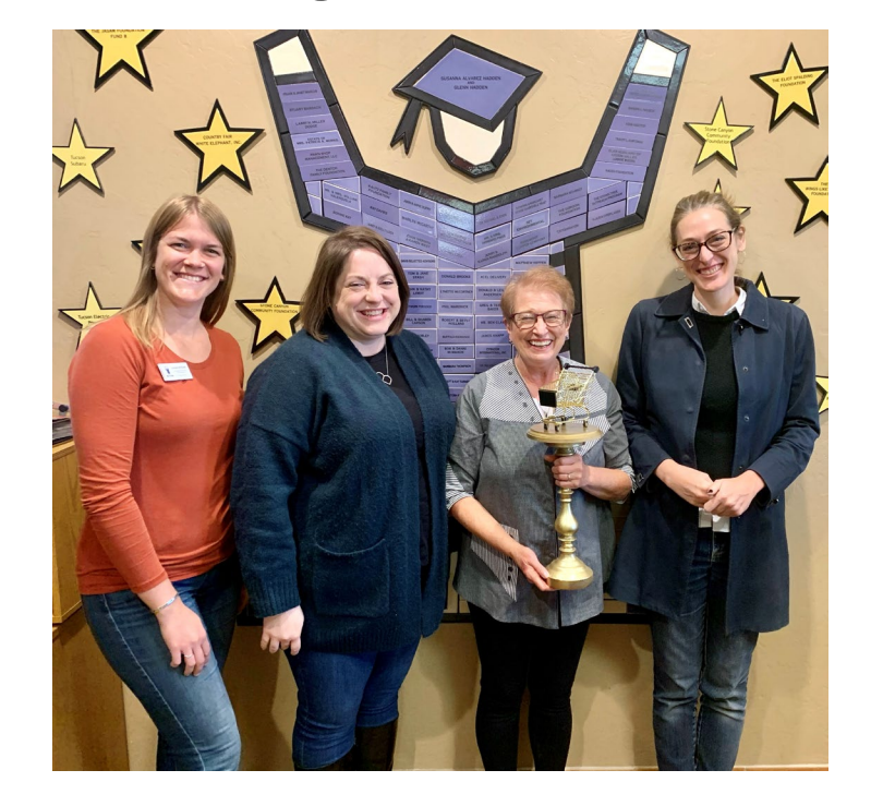
Stocktober 2022 Winners!