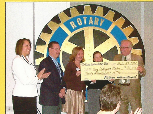
Masquerade Committee presents a $30,000 check to members of the Mesa County Meth Task Force for Drug Endangered Children

For over 50 years Grand Junction Rotarians have rung bells in support of the Salvation Army. We host a visiting team in the JUCO World Series. Our gala Masquerade event has raised tens-of-thousands of dollars. The list of local non-profits that have been supported by our club is extensive and includes Marillac Clinic, Partners, Mesa Developmental Services, Hospice & Palliative Care, Hilltop and many others.