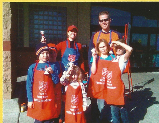
Ringling bells for the Salvation Army