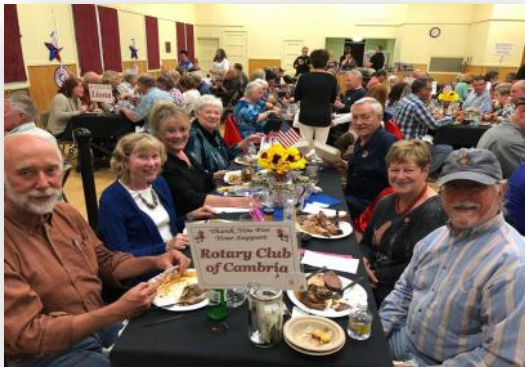
Tip A Cop Dinner