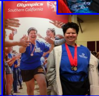
New Board/Old Board Social