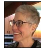
The New Patty Griffin