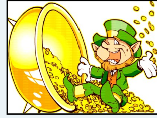
One can only assume that the winner of the Lucky Buck was a disappearing leprechaun since no further information was provided.