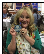
Karen Come Lately