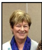
Paula Come Lately