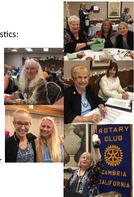
Just a few of our amazing Women Rotarians.