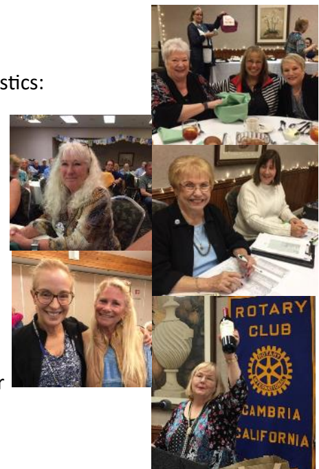
Just a few of our amazing Women Rotarians.