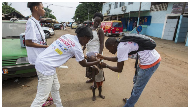
Immunization efforts continue in Africa, where recent setbacks underscore the need for vigilance everywhere until polio is eradicated worldwide.

The wild poliovirus has caused fewer new cases of the disease so far this year than this time last year, but recent setbacks in Nigeria — which was re-classified as polio-endemic in September 2016 — underscore the need for vigilance.