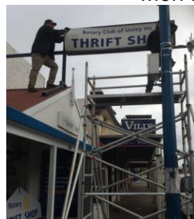
Jerry's son-in-law in action with JC supervising