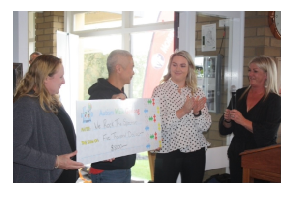
We Rock the Spectrum Gym & Autism Walk Geelong