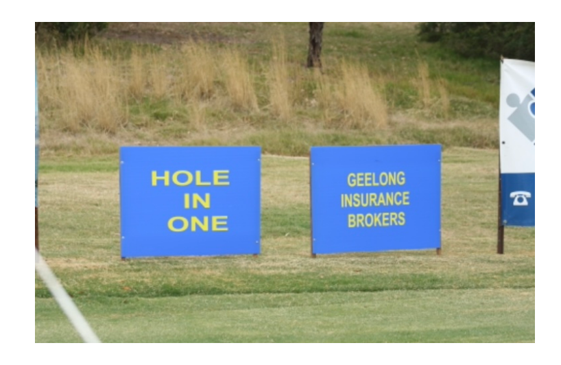
The Ray White No. 2 Team