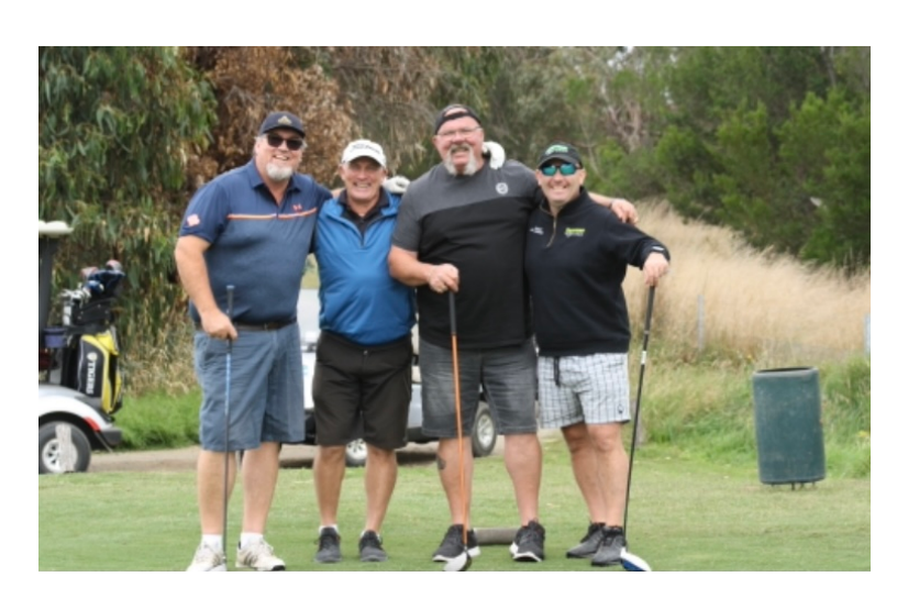
The Mick Anic Wholesalers & Panther Tyres Team