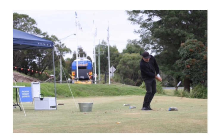
'Chip a golf ball in the boat' challenge at the 10th hole