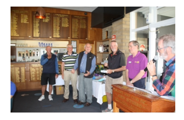
The leading Rotary Club Team (Kardinia)