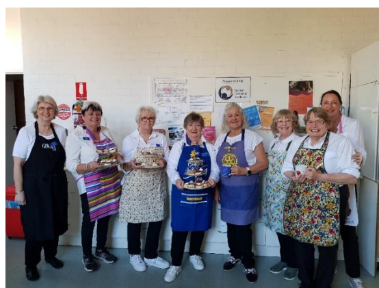
Workers preparing the food

On Saturday May 13 th the RC Bayside Geelong hosted an "Elegant High Tea" at the Christ Church Community Hall. Although we didn't get the numbers we were hoping for, the afternoon was a great success and raised over $2,000. Members, family and friends all chipped in to donate the food, coffee, tea, wine, glasses, crockery, raffle prizes, flowers and plants, bunting and tablecloths. The hall looked wonderful and the guests were treated to a lovely afternoon tea and fun activities.