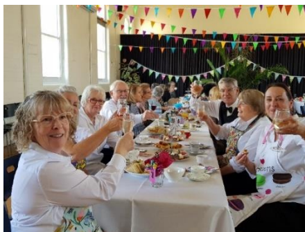
The Bayside Geelong RC Team celebrating a successful event

A HUGE THANK YOU must go to everyone who helped to make the afternoon a great success!!!