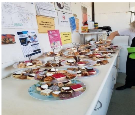
The yummy Food Plates