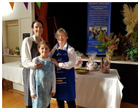
Three Generations helping on the day