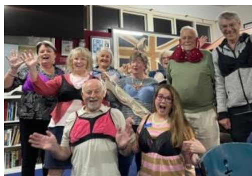
Bra Muster - Bras for PNG

The club has continued its support of DIK Geelong (now called RARE – Rotary Australia Repurposing Equipment) - with donations of supplies to international communities in need, particularly PNG and Pacific regions. The club also supported the “Bras for PNG Project”. The club collected over 400 bras from family, friends and other rotary clubs in the local Geelong area. These were taken to DIK Geelong where they were loaded into a container and shipped to PNG supporting the local women in need.