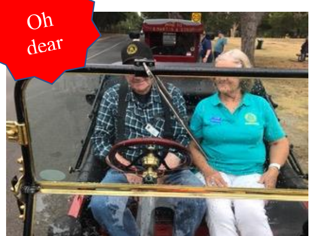
Great start to our part of the relay in Eastern Gardens.