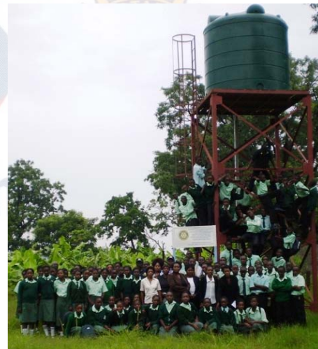
Official opening of the new facility