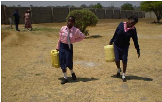
This photo showing how students had to carry water each time they had to use the toilet facilities.

At the beginning of the Rotary Year, Clubs were invited into a Matching Grant program that would provide running water to toilet facilities at a Zambian High School. Water was available at the school, but had to be manually carried from a well in containers to where it was required to be used. Funds for a Grant were then requested to have water pumped from the well to an elevated water tank which had to be constructed, and then water would be gravity fed to the toilet facilities. We agreed to be involved, and shared the project with 6 other Clubs. Six months later, we were advised that the project had been completed