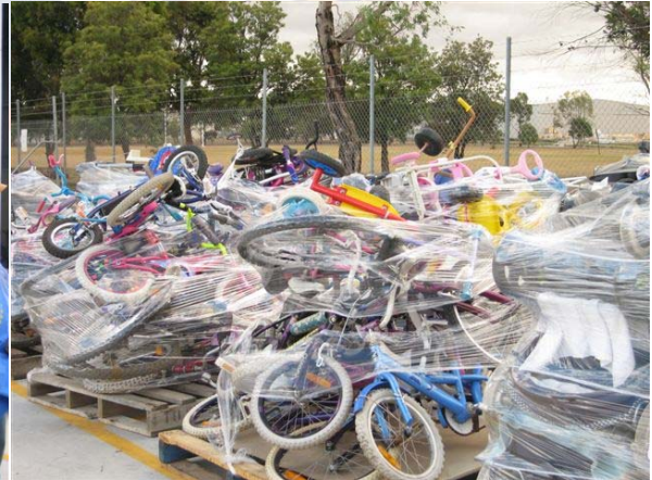
Some of the donated items

A Sausage Sizzle was conducted at Freshwater Creek the following weekend which raised funds for the Fire Effort.