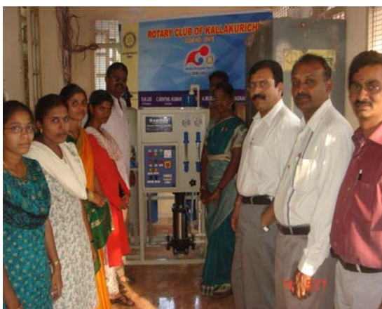
The installed Osmosis equipment