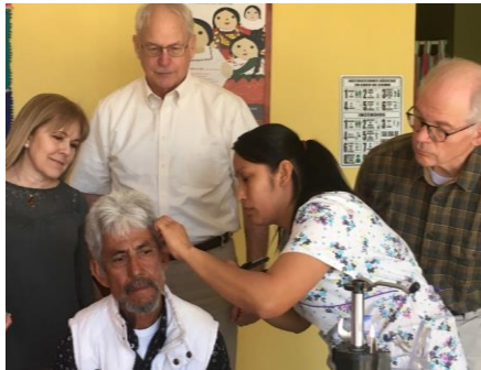
Club members oversee a patient fitted with a hearing aid in the Rotary hearing clinic in San Felipe.