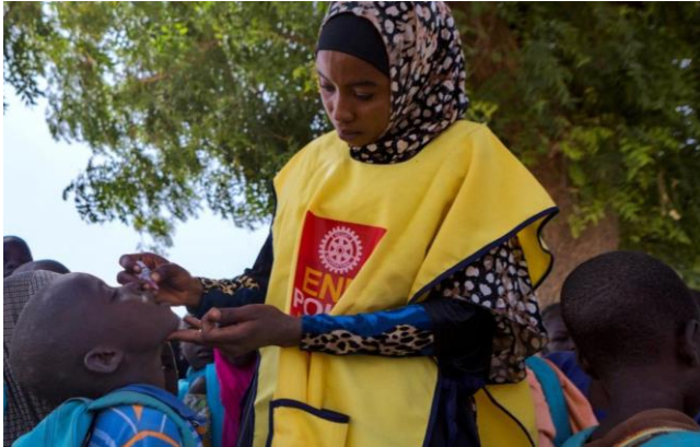
Sponsored by Rotary International, Polio Plus is a worldwide initiative to eliminate polio.