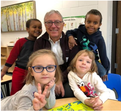
Club members read with students at Seward Montessori School, Minneapolis.

Recent projects of the Minneapolis University Rotary include a literacy program at Seward Montessori School in Minneapolis and cataract surgery and audiology programs in San Felipe, Mexico. All our projects address identified needs, build relationships, and make a difference in people's lives. We live the Rotary motto "Service Above Self".