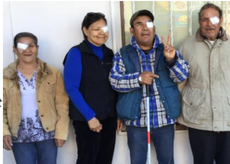
Patients enjoy restored eyesight through the Rotary/Better Together cataract surgery program in San Felipe.