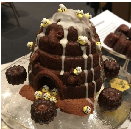
The Beehive Cake