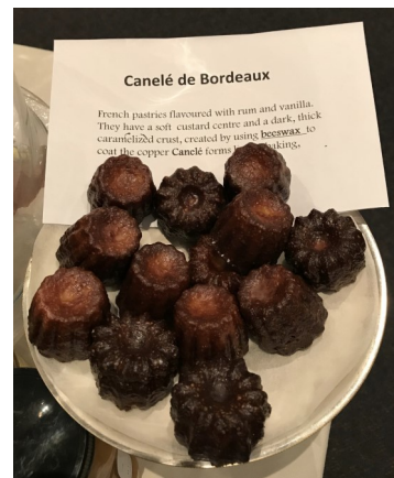
Canelé de Bordeaux