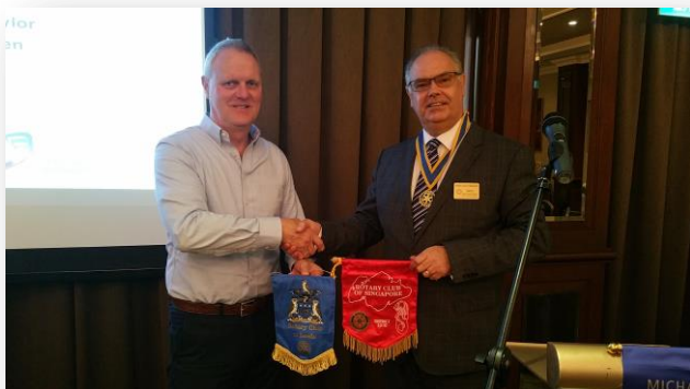
Exchange of banners with Rotary Club of Leeds UIC