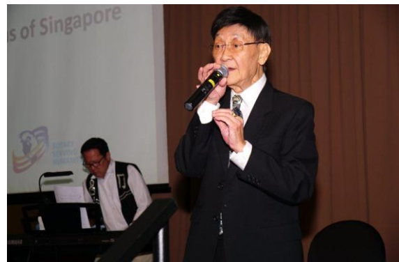
Lyrical Singer Chin Whai