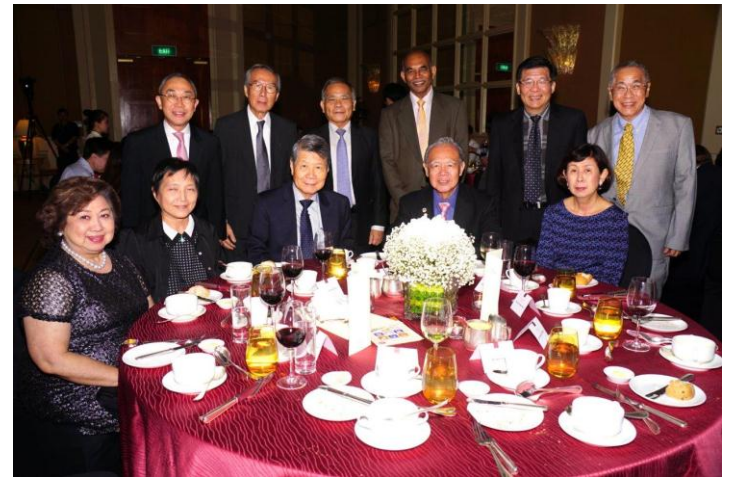
At the dinner tables...