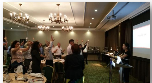
Members happily trying out the Laughter Yoga exercises