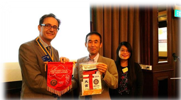
Exchange of banners between RCs Omiya & Singapore