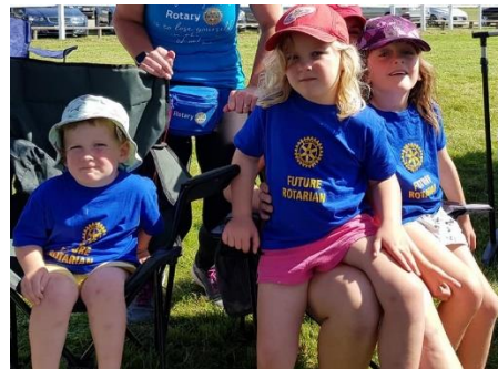
Watch out for these three, already working on their Rotary tshirt collection!