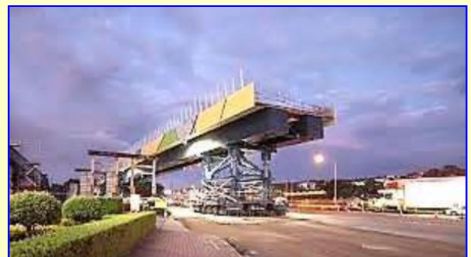
A section of bridgework for the Darlington Upgrade Project constructed off site ready for transport into position.