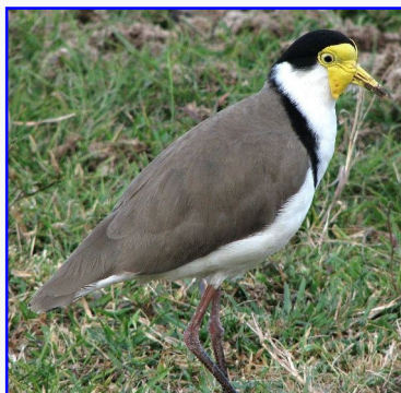
Masked Lapwing (Masked Plover)