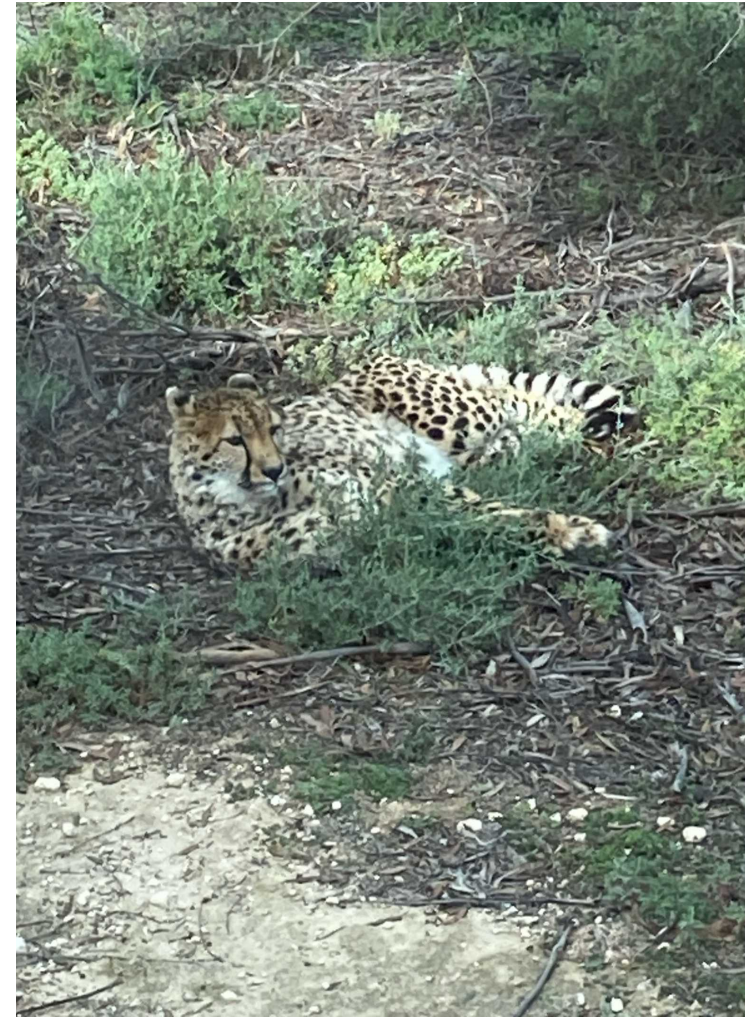
“Never prosper” Monarto Safari Park Sunday May 31st