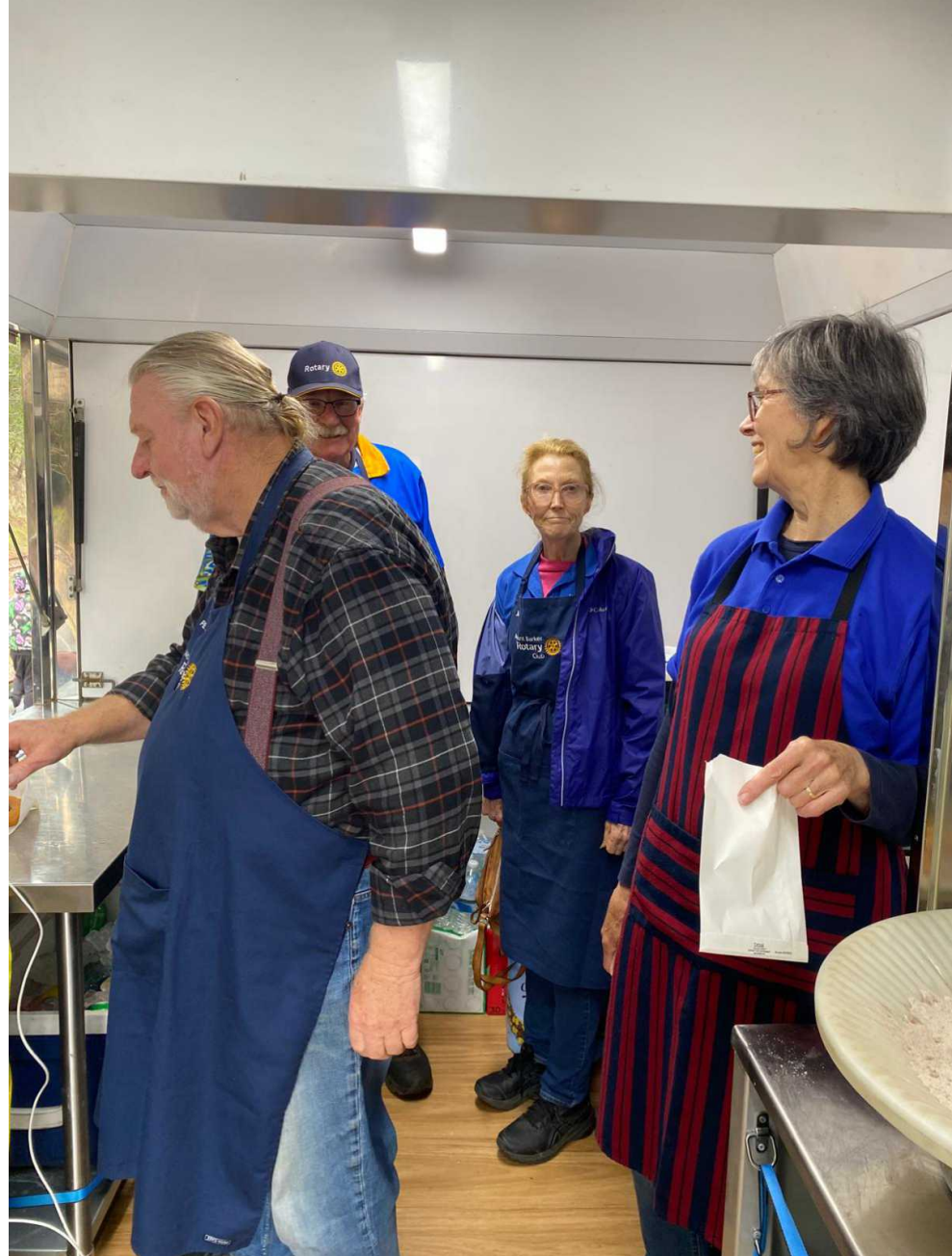
Railfest at SteamRanger. Sunday May 24 th