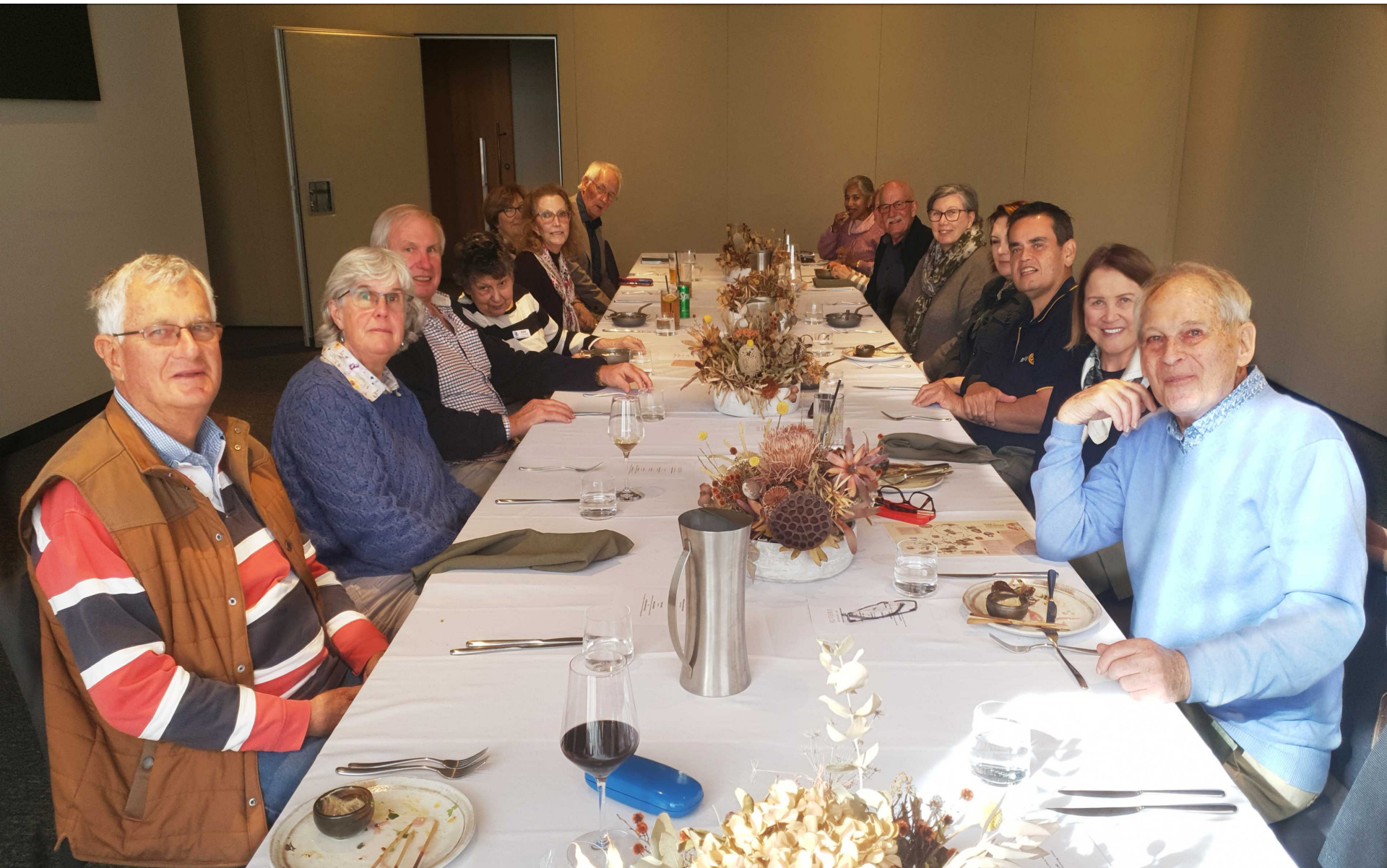
Lunch at Monarto Safari Park. Sunday May 31 st