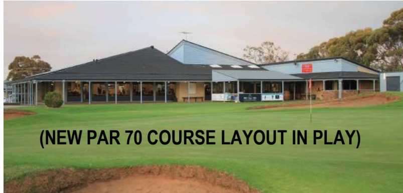
(NEW PAR 70 COURSE LAYOUT IN PLAY)