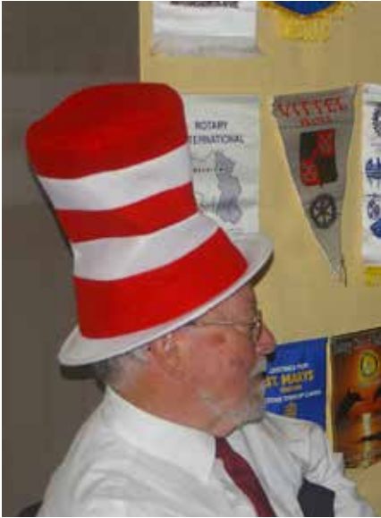
Dr Seuss - Kennedy