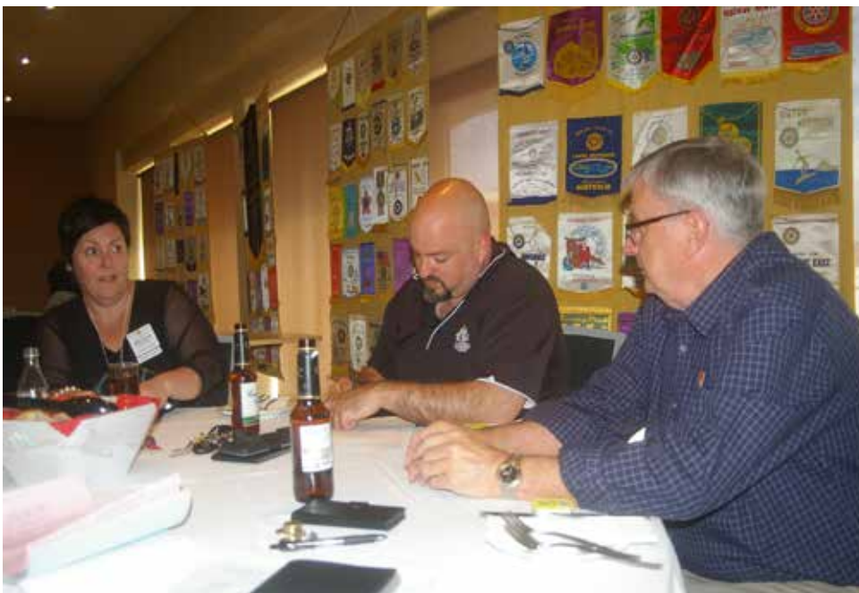
Last minute preparations for the meeting.