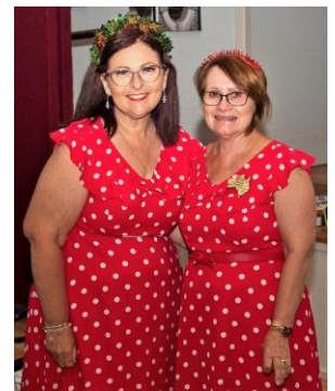
Santa's little helpers