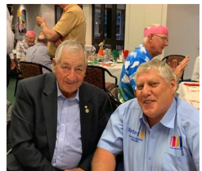
Happy snaps from our Christmas Party