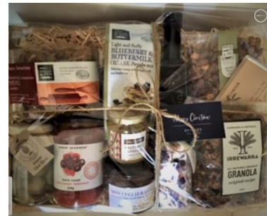
Epicure Hamper Raffle.